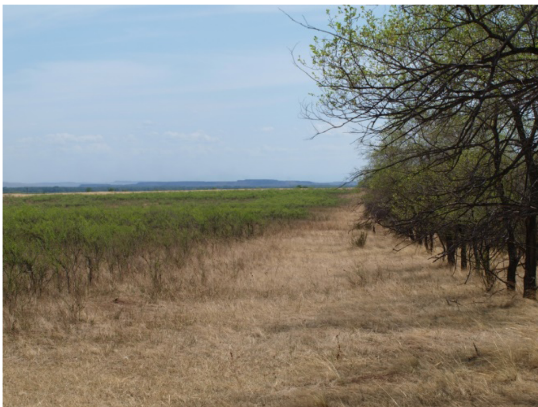
Fig. 2. Ulmus pumila growth on the leeward side of a forest belt 21 May, 2022. Photograph by T.V. Zlotnikova.