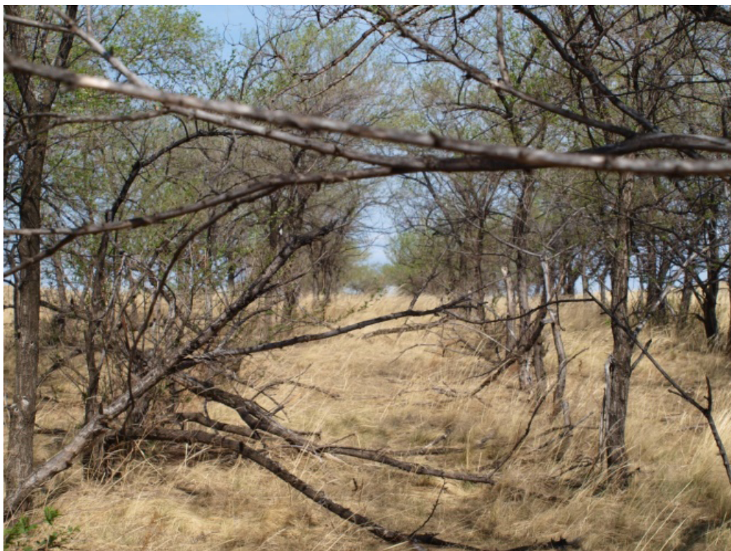
Fig. 1. State of the forest belt stand 21 May, 2022.