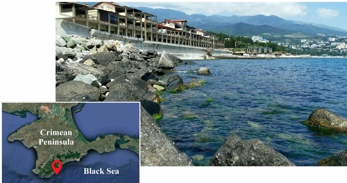
Fig. 1. Location of the hydrobotanical station (N 44°31'41.7" E 34°16'23.8") and general view of the surveyed area of the coastal zone (Gurzuf, Southern Coast of Crimea).

catering, accommodation and recreational services), and therefore, in accordance with the seasonal recreational and tourist load, is at its maximum in the summer. Having been designed according to the 1960s threshold limit values, the STP does not comply with modern standards and is 98% worn out, and the damaged collector regularly produces large-scale emergency emissions along its entire length (Gruzinov et al., 2018; Pupyrev, 2015).