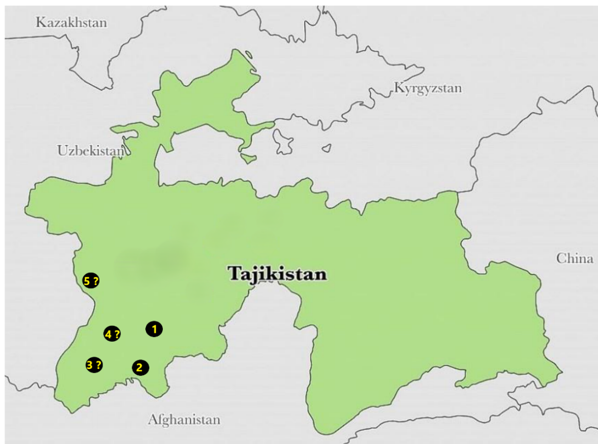
Fig. 2. Distribution of Euchloe tomiris in Tajikistan. 1 – Tabakchi Ridge; 2 – Panj Karatau Ridge; 3 – Aktau Ridge; 4 – Aрукtau Ridge; 5 – Babatag Ridge.