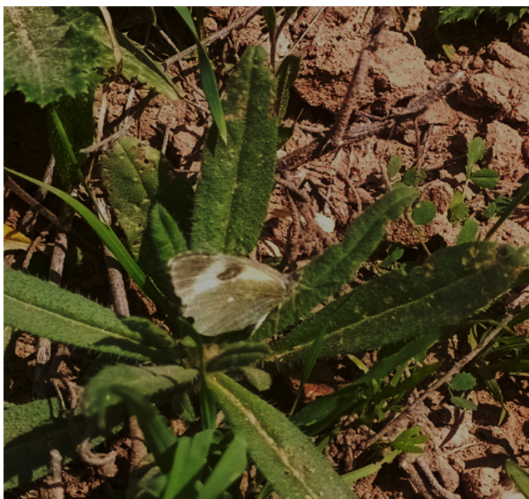
Fig. 1. Appearance of a butterfly Euchloe tomiris .